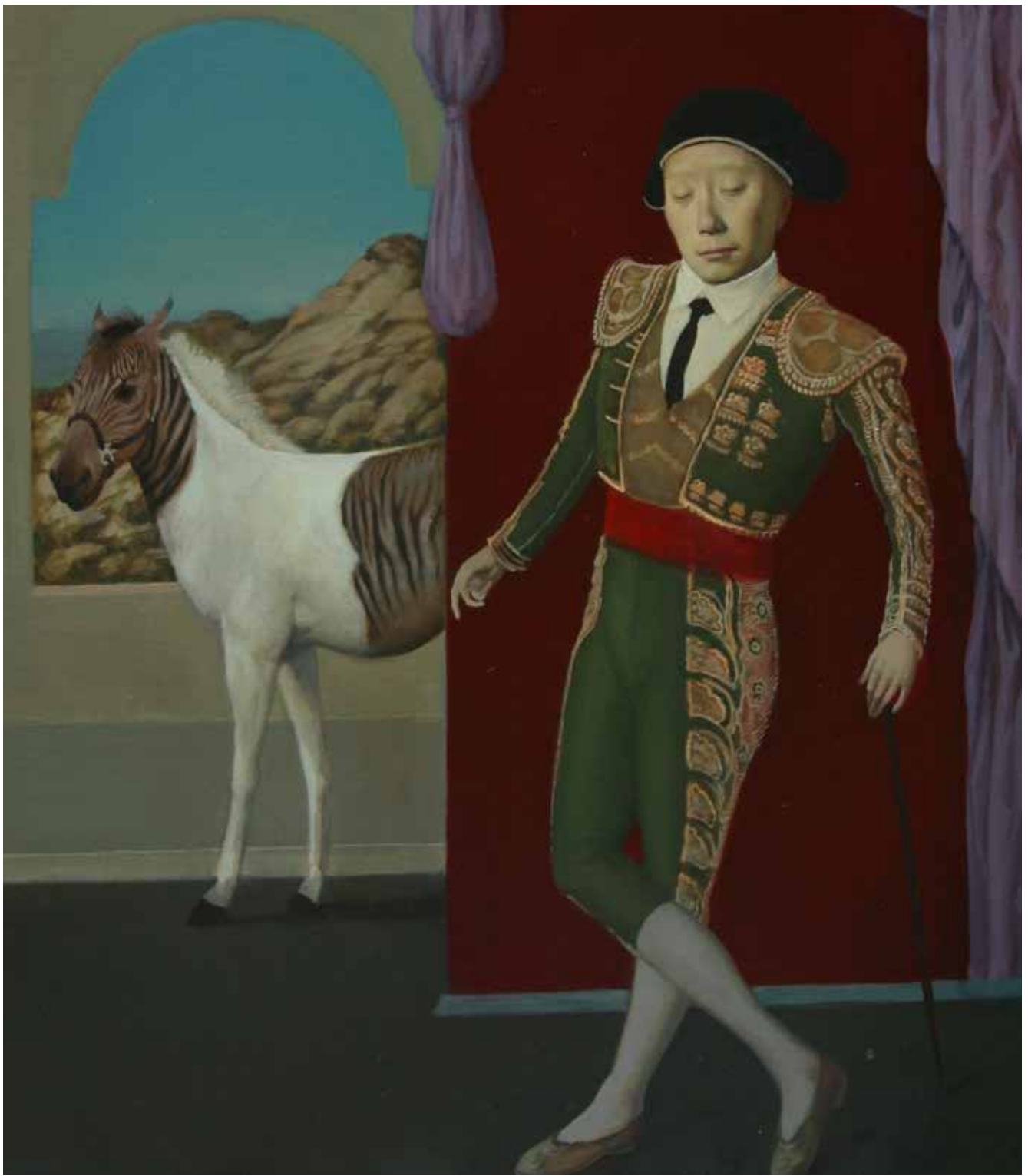
Montserrat Dream, 2017 30 x 24" Oil on Canvas