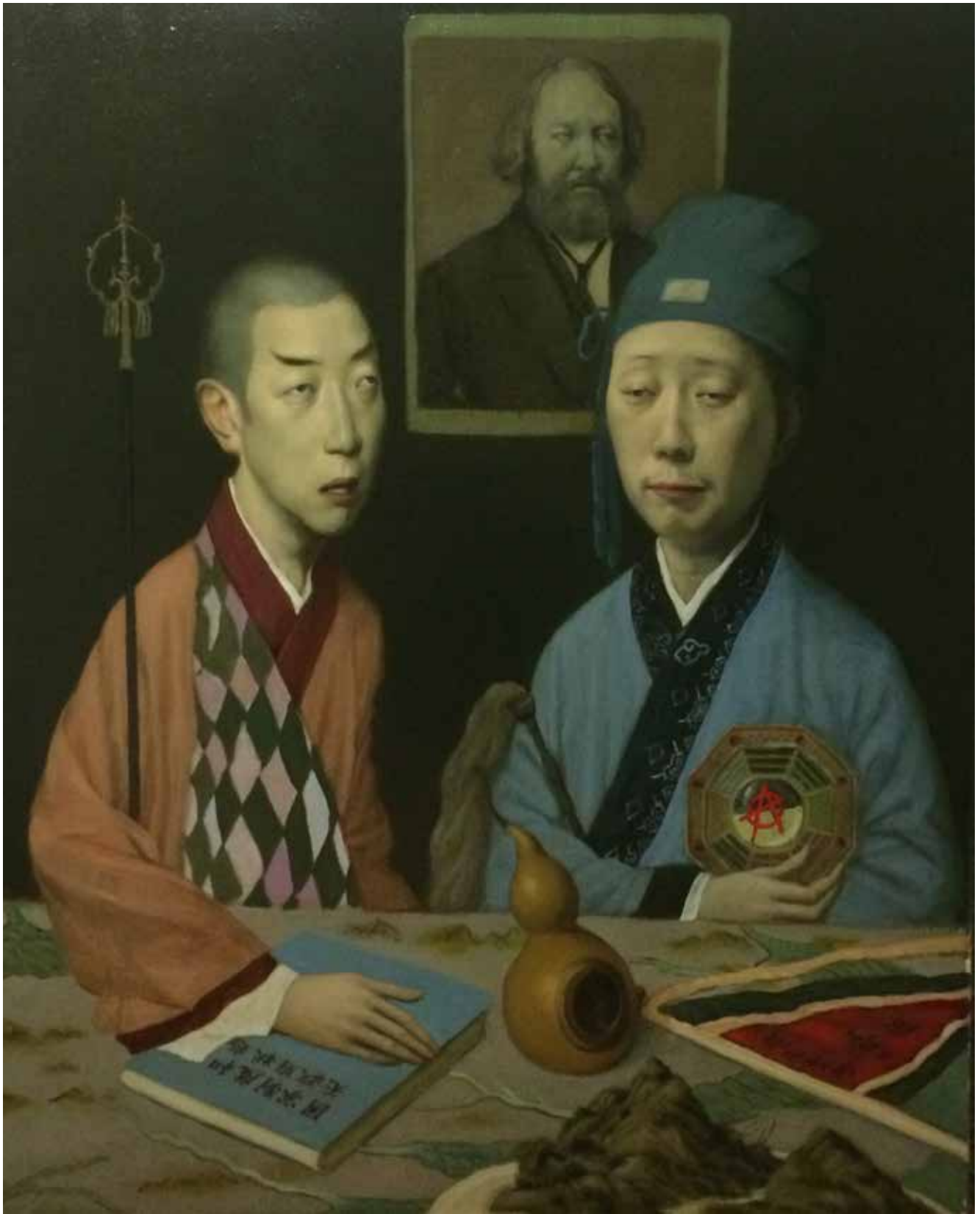
Friends, 2017 48 x 36" Oil on Canvas