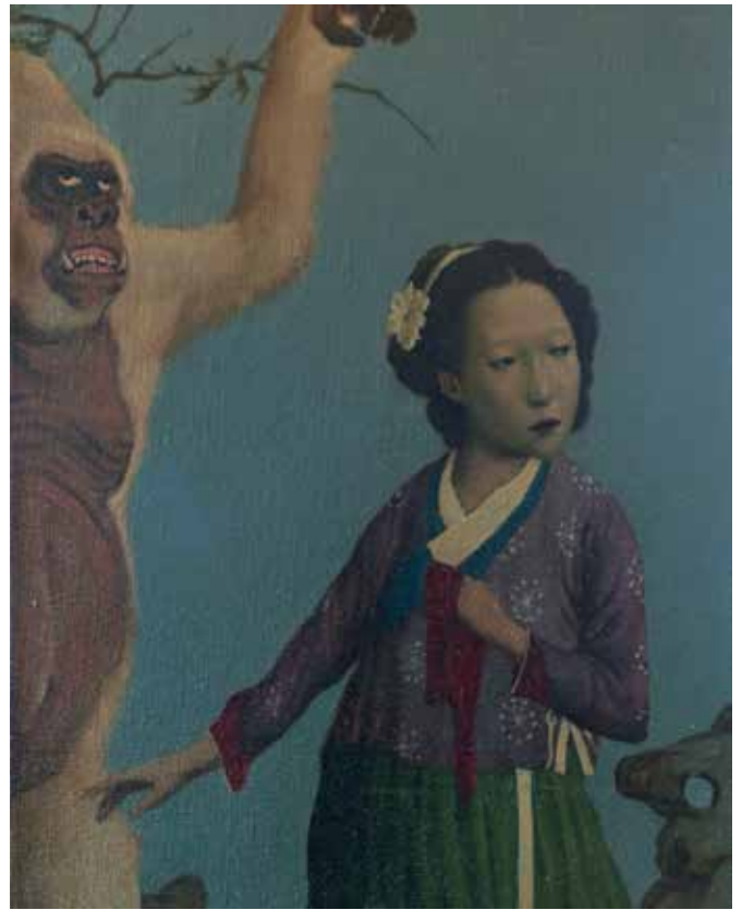
Meet The Legendary Monkey, 2017 16 x 13" Oil on Canvas