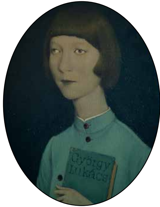
Left Wing Girl, 2017 16 x 13" Oil on Canvas