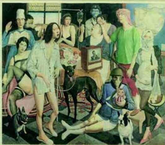
Truth: The artist surrounds his characters with props, objects culled from art and pop culture history.