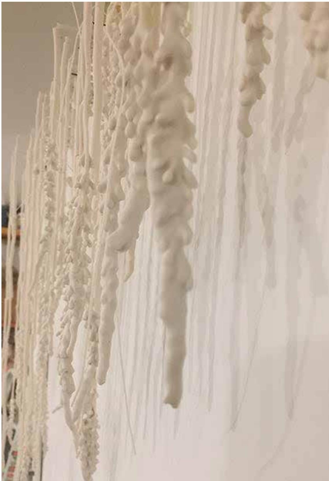
Wall Piece (Detail), 2017 3 X 5' Porcelain paper clay, Waxed linen Thread, welding rod