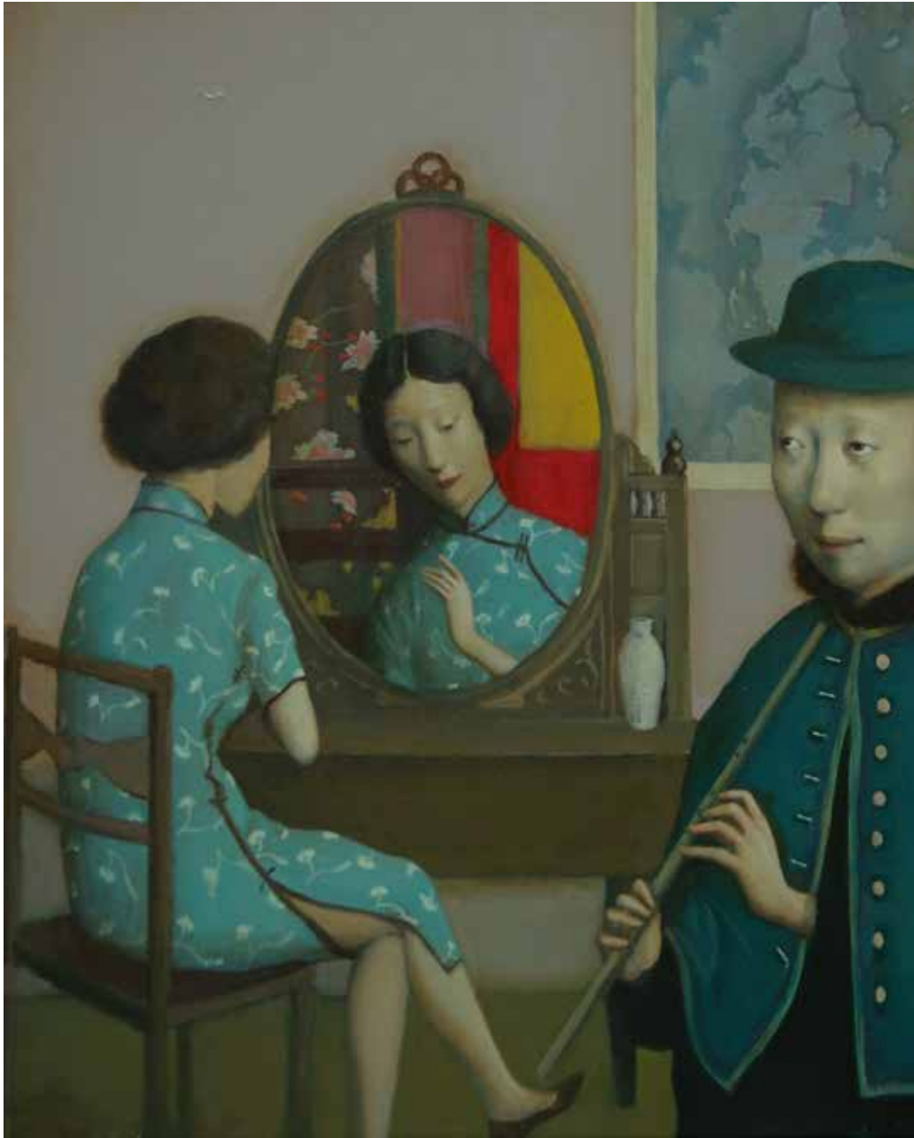
Mirror, 2017 20 x 15" Oil on Canvas