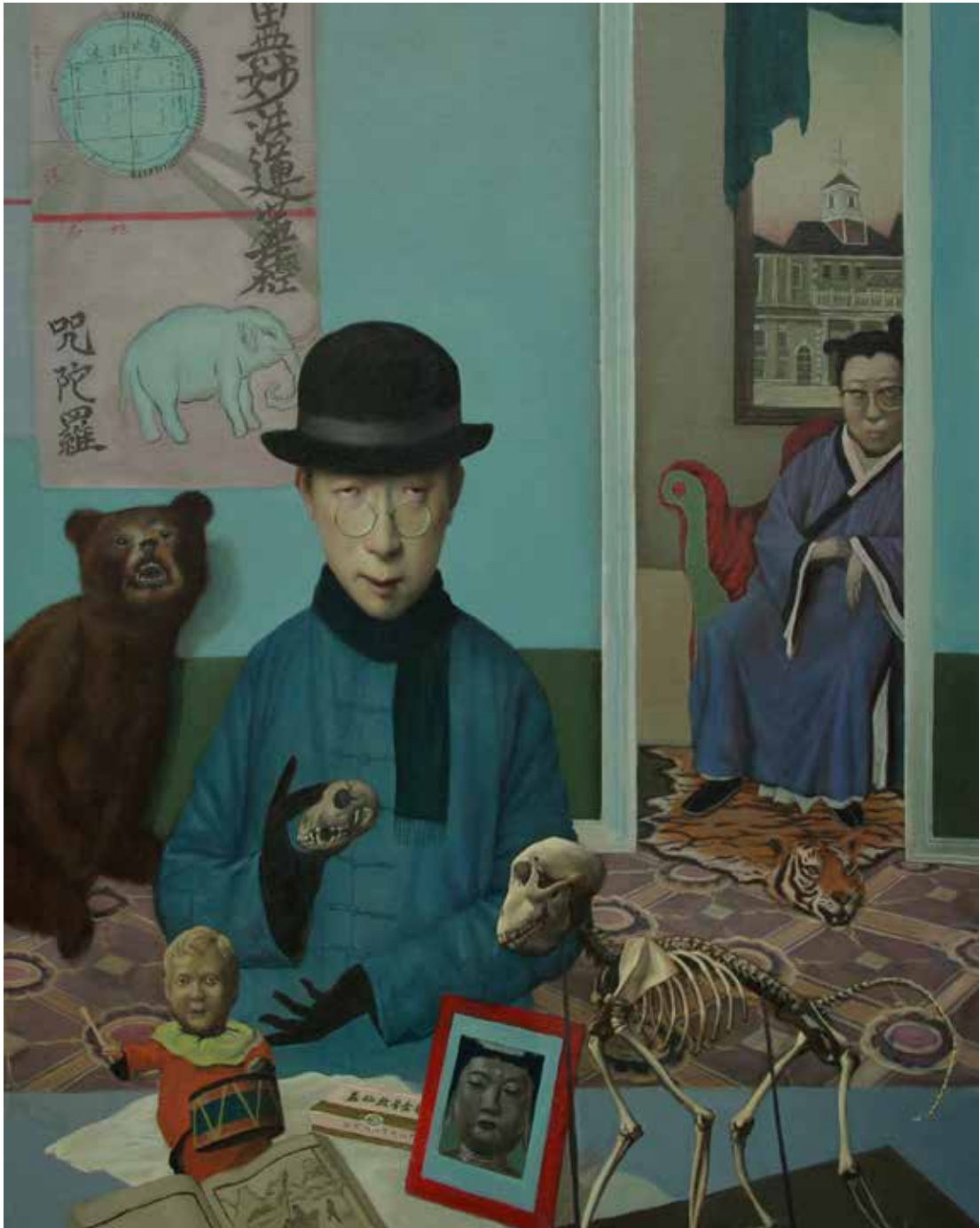
Human Shape Object, 2017 48 x 36" Oil on Canvas