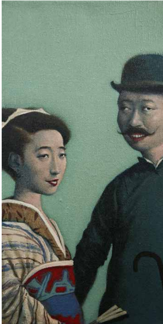
Harmony, 2016 18 x 9" Oil on Canvas