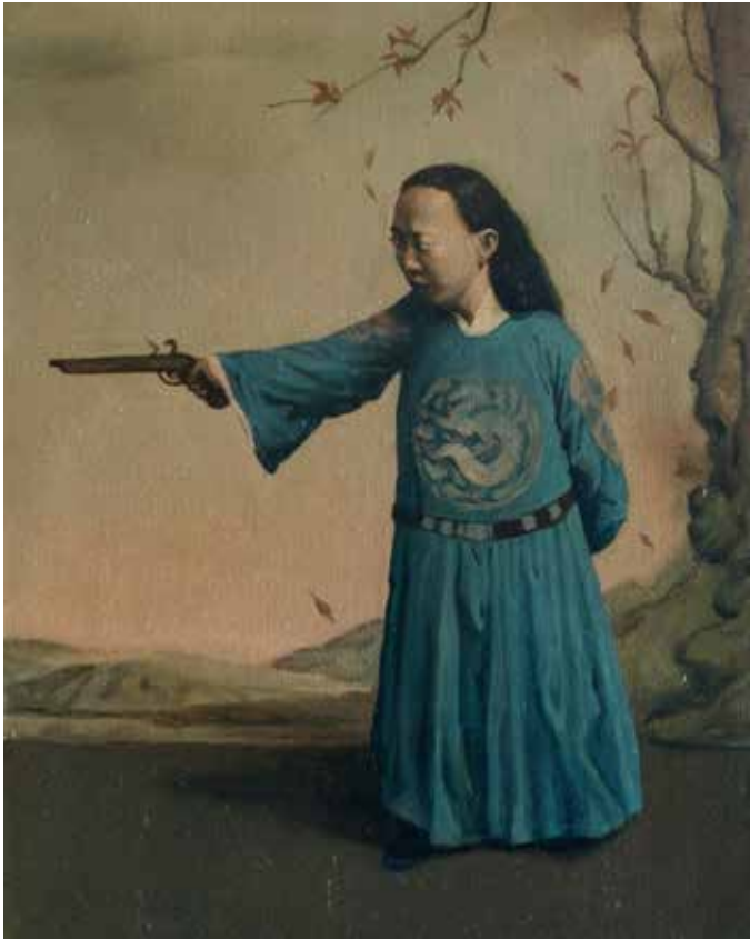
The Autumn Sonata, 2017 16 x 13" Oil on Canvas