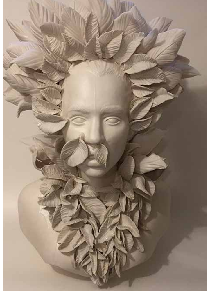
Viral Series: Ruff 2, 2017 12 x 9 x 20" Porcelain, paper-clay slip, glaze