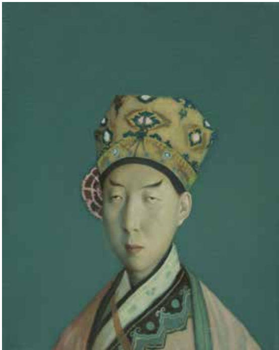
In Front of Kali, 2017 14 x 11" Oil on Canvas