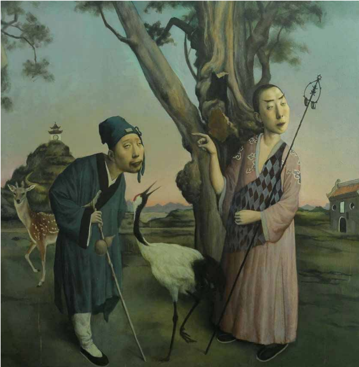
A Buddhist and a Taoist Priest, 2016