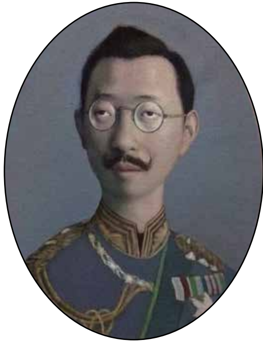
The Emperor, 2017 16 x 13" Oil on Canvas