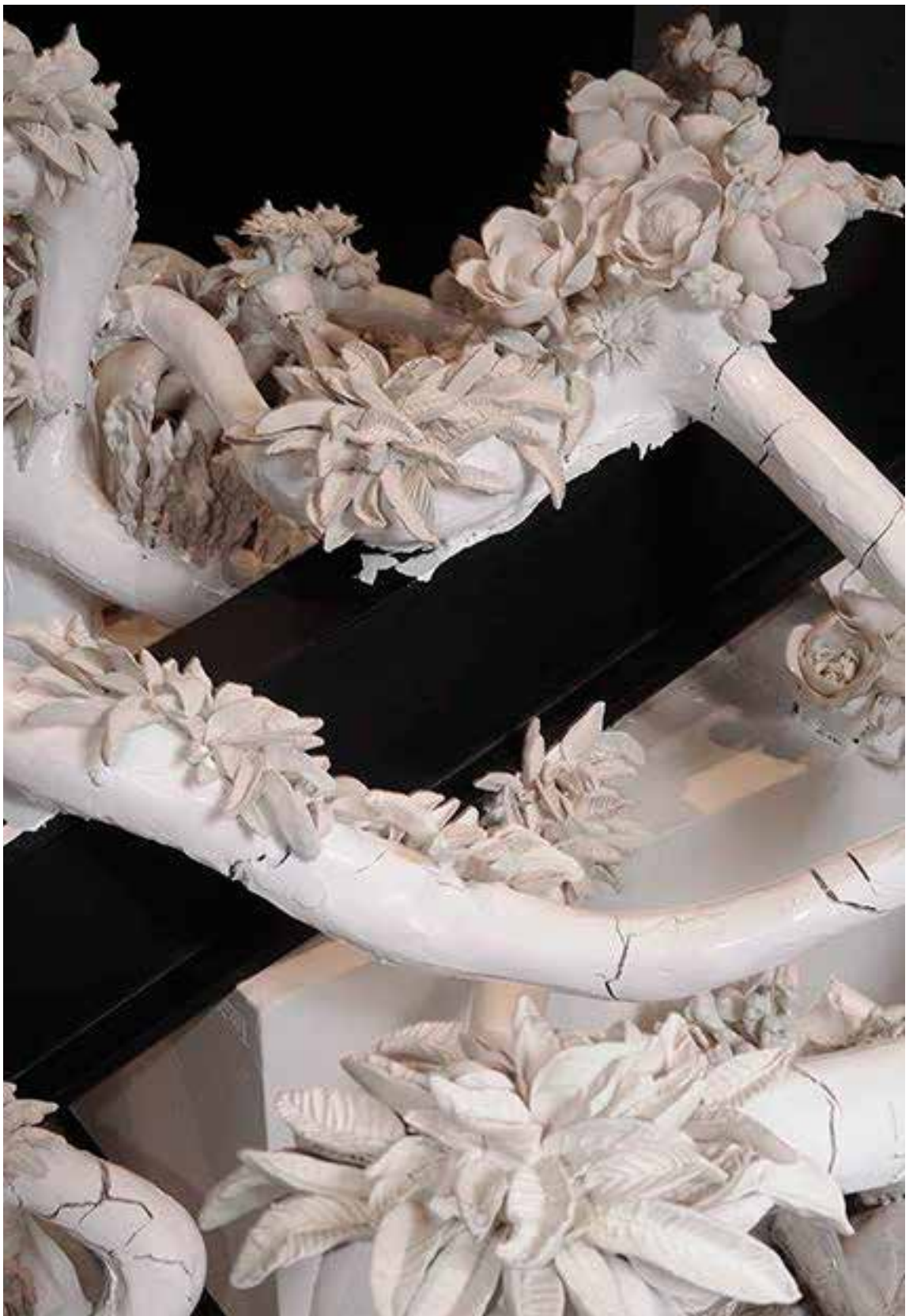
Floor Piece (Detail), 2017 Ceramic, raw clay, acrylic ink, latex paint, pvc tubing, plumbing tape Price upon request