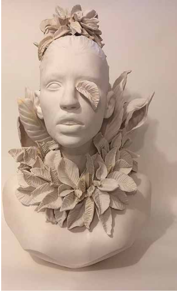
Viral Series: Ruff 1, 2017 12 x 9 x 20" Porcelain, paper-clay slip, glaze