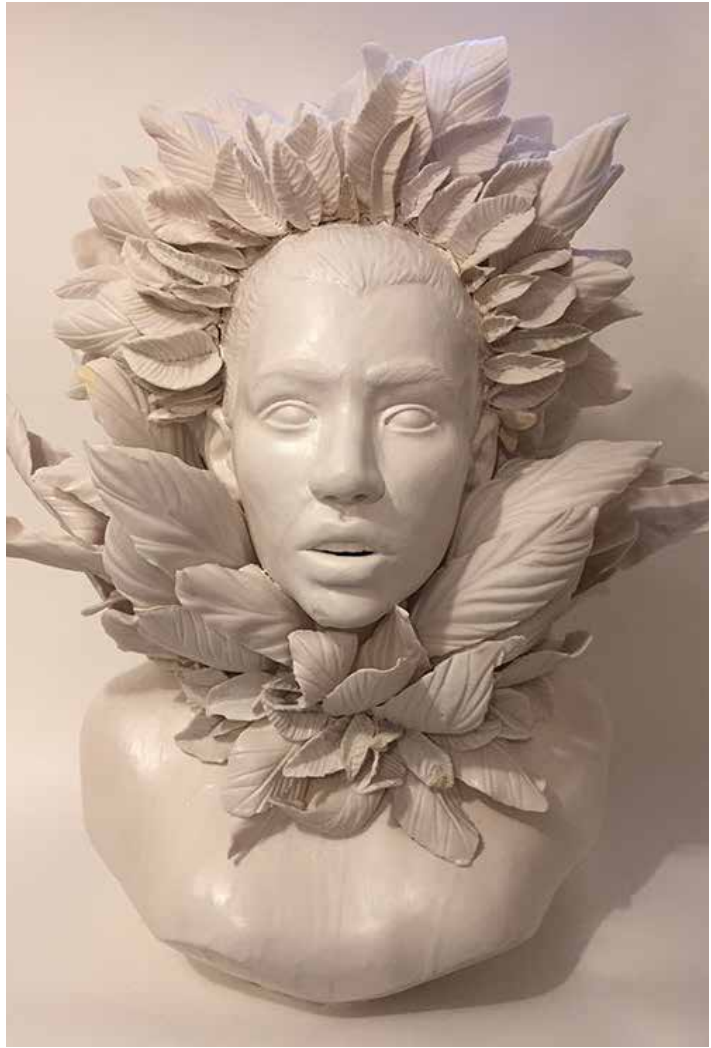
Viral Series: Ruff 3, 2017 12 x 9 x 20" Porcelain, paper-clay slip, glaze