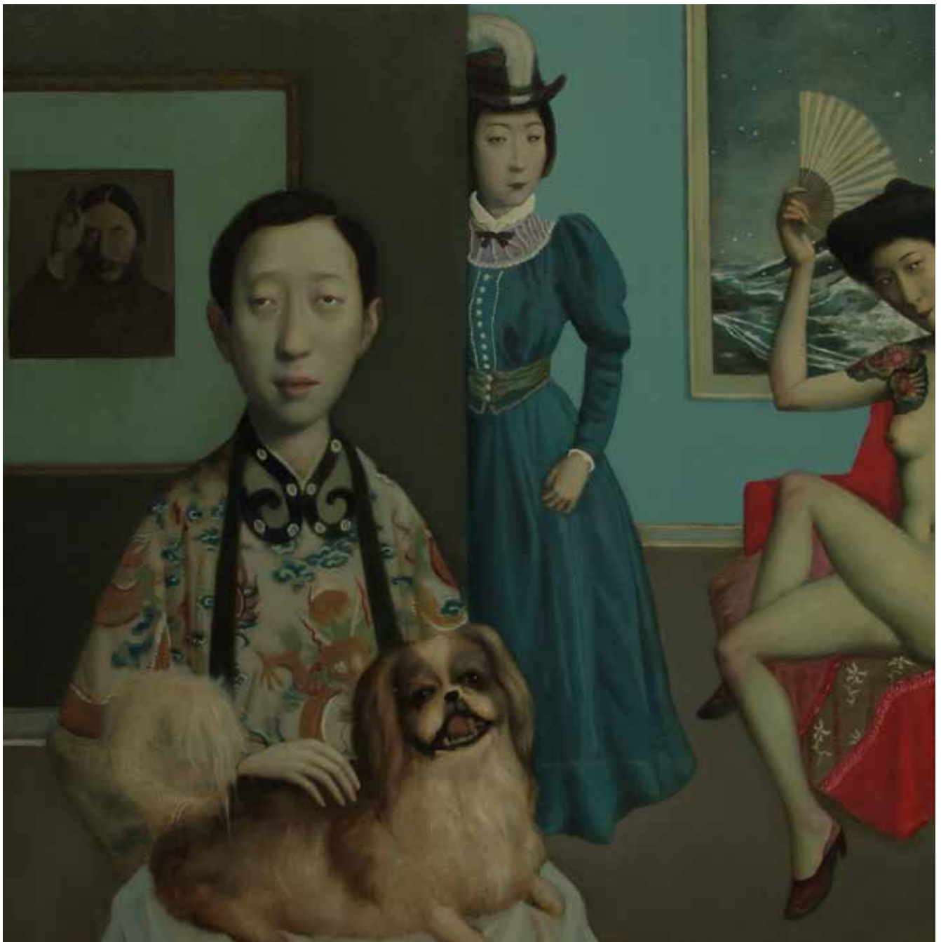
Snowy Day, 2017 30 x 30" Oil on Canvas $6,300