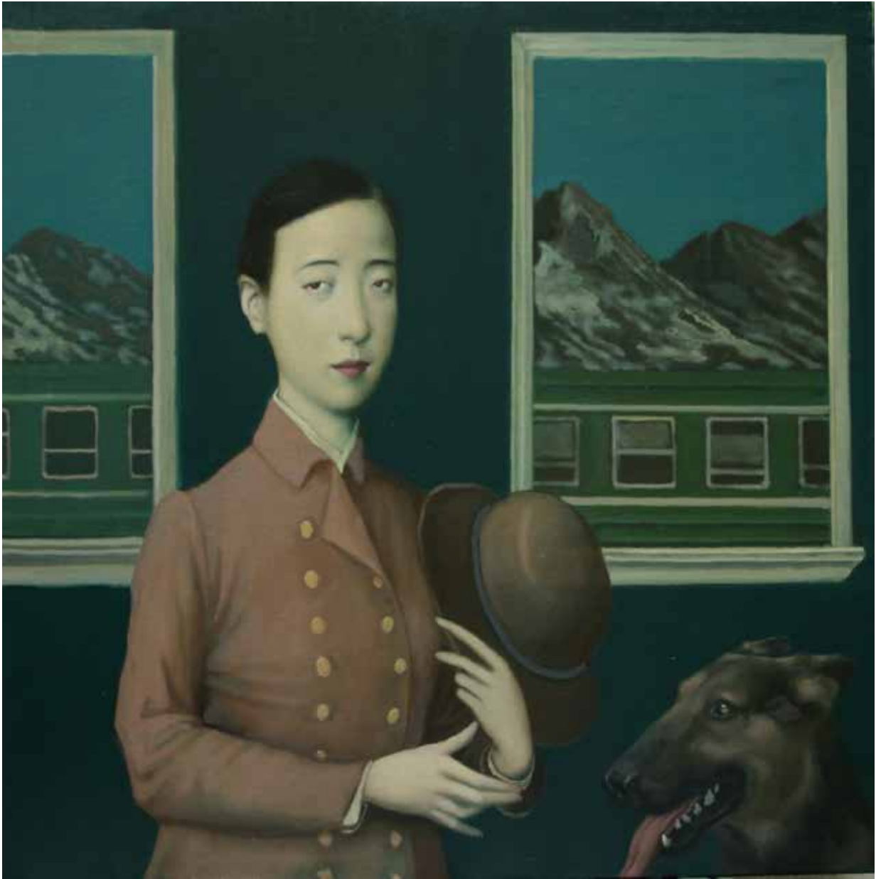
Detective, 2017 24 x 24" Oil on Canvas